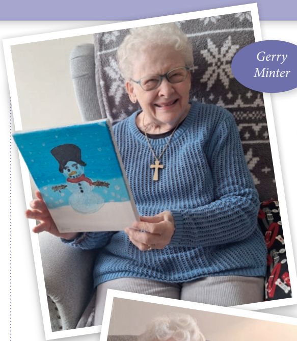
A dab here and a dab there! Each resident created a unique snowman on a cool, winter background.