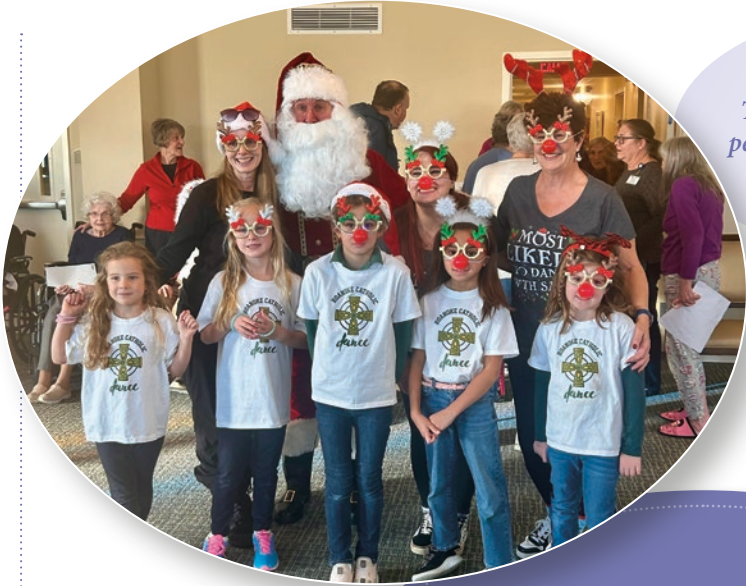
The Roanoke Catholic Dance Team (left) and their live nativity performers entertained residents on separate occasions.