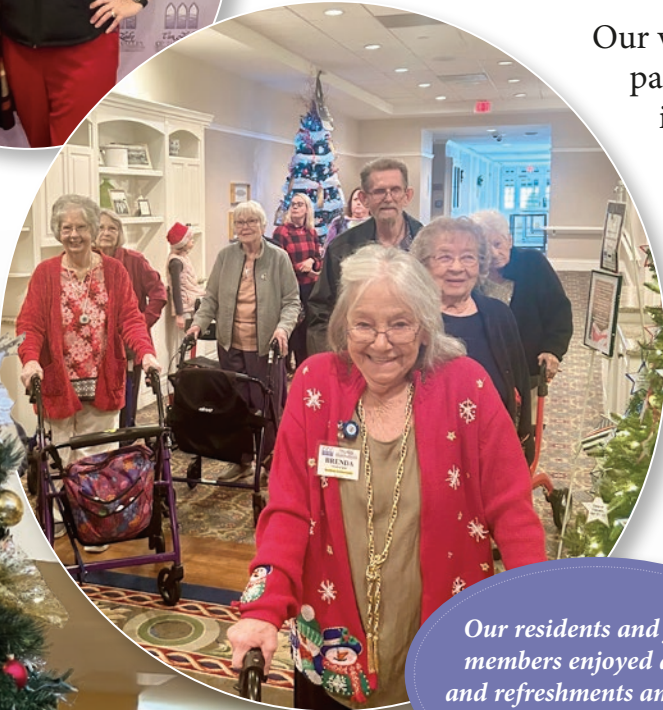
Our residents and family members enjoyed a stroll and refreshments among the festive decorations.

Guests and residents enjoyed sweet and savory treats and took pictures in front of our new OLOV backdrop!