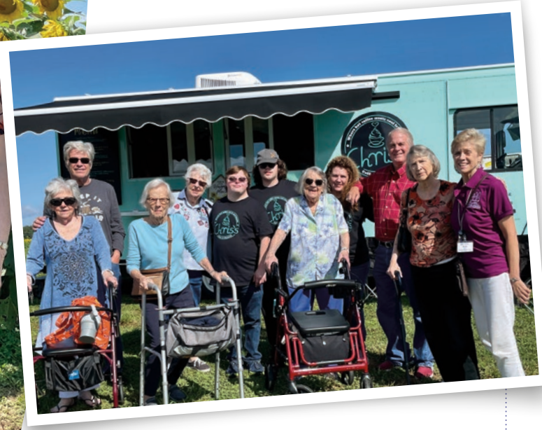
Our group was excited to grab a snack and a photo at Chris's Coffee & Custard Food Truck.