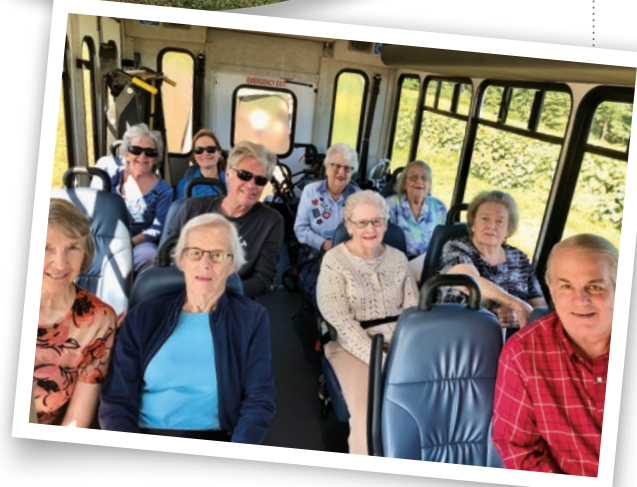
Let's ride! The Valley bus was packed with sunflower enthusiasts.