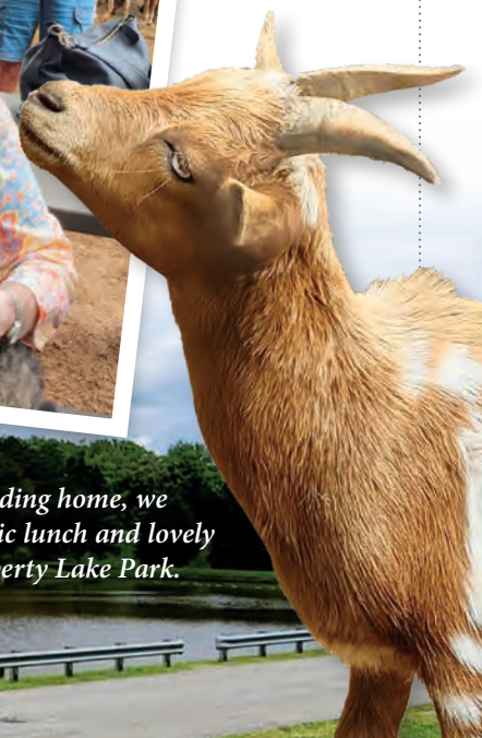
Before heading home, we enjoyed a picnic lunch and lovely views at Liberty Lake Park.