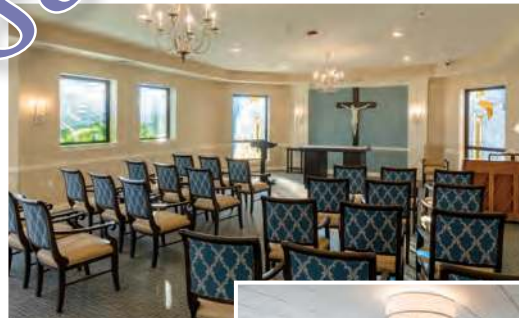
Our new Chapel and Christopher Center sunroom.